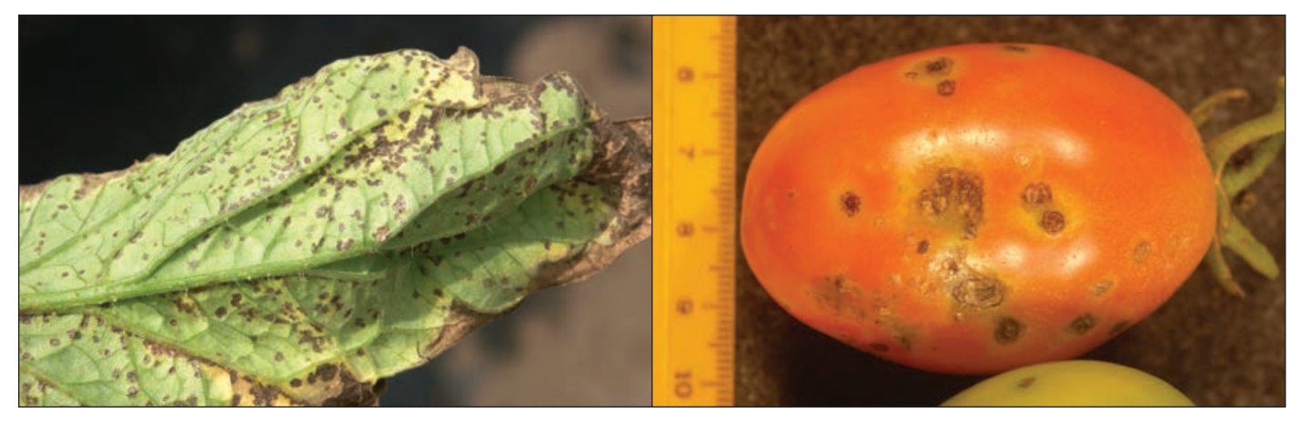
Figure 1. (Left) Bacterial spot of tomato causes small necrotic lesions on leaves that are often accompanied by chlorosis. (Right) Lesions on fruit are often scabby in appearance. See page 122 for management options.