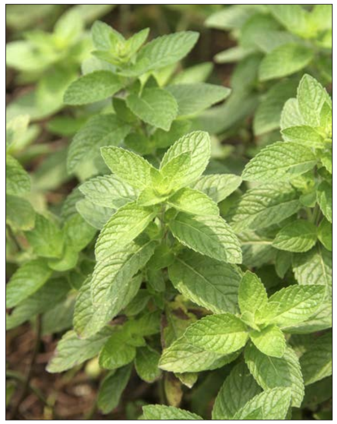
Varieties of mint grown for fresh market differ from those grown for processing.

This is a reduced-risk pesticide. See page 34 for details.This is a biopesticide. See page 34 for details.