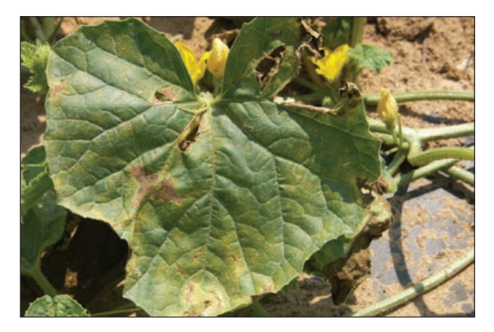
Figure 13. Manganese toxicity on cantaloupe is a disorder that can occur if soil pH is too low. See page 99 for soil pH and fertility recommendations for cucumber, cantaloupe, and watermelon.