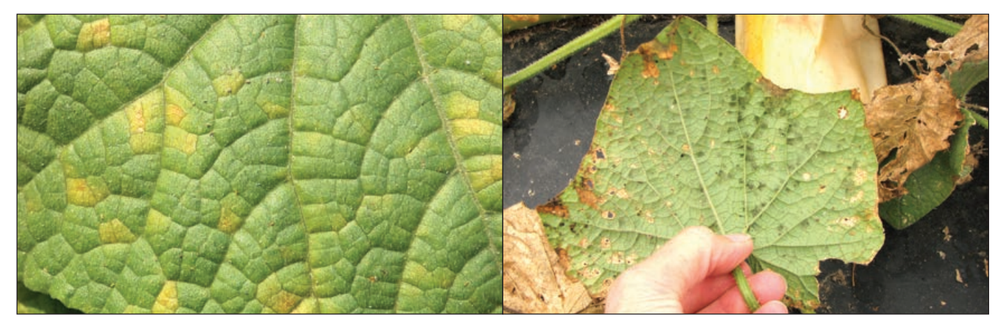
Figure 4. (Left) Downy mildew of cucumber causes angular chlorotic lesions. (Right) During moist conditions, the fungus that causes downy mildew is visible on the undersides of infected leaves. See page 102 for management options.