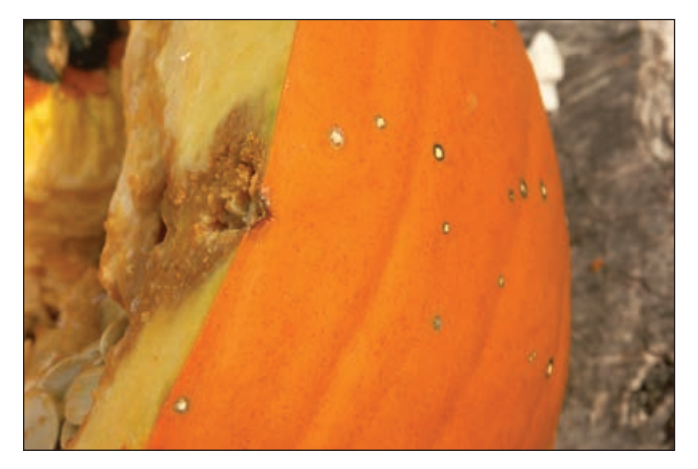
Figure 2. Bacterial spot lesions on pumpkin are light colored with watersoaked margins. The cut open pumpkin shown here has a secondarily infected lesion that has rotted through the fruit. See page 92 for management options.