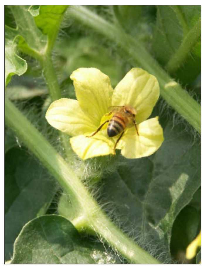
Make sure to work with beekeepers to avoid applying pesticides that could harm the bees.

Ohio law requires applicators to notify beekeepers 24 hours before applying a pesticide labeled as toxic to honeybees if: (1) the crop to be treated is in bloom, and (2) the field is greater than a half acre and within half a mile of a registered apiary. Contact your state's department of agriculture to see if a similar law exists to protect pollinators.