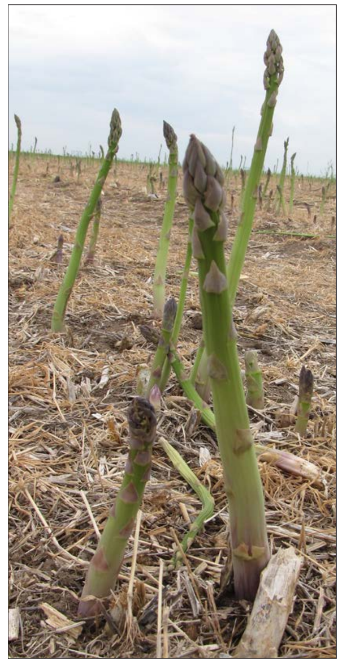
Harvest asparagus spears in the morning for best quality.