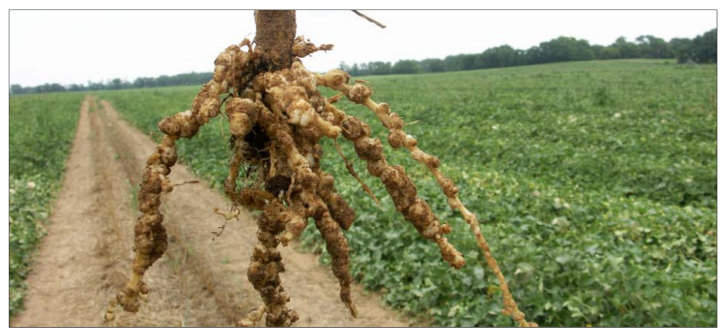
Belowground symptoms of root knot nematodes include roots with enlarged galls.

F=fumigant N=nematicide RUP=restricted use pesticide