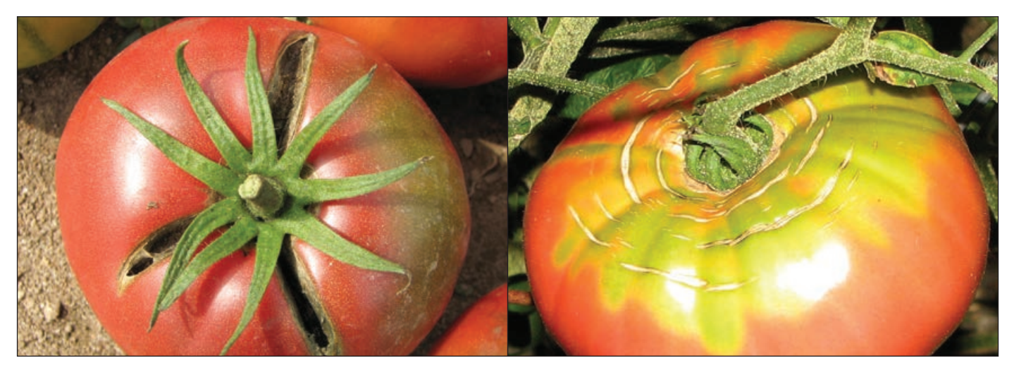
Figure 16. Radial (left) and concentric cracks on tomato. See page 114 for more information.