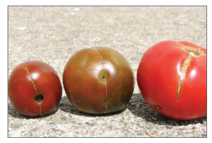
Figure 17. Zipper scars on tomatoes. See page 114 for more information.