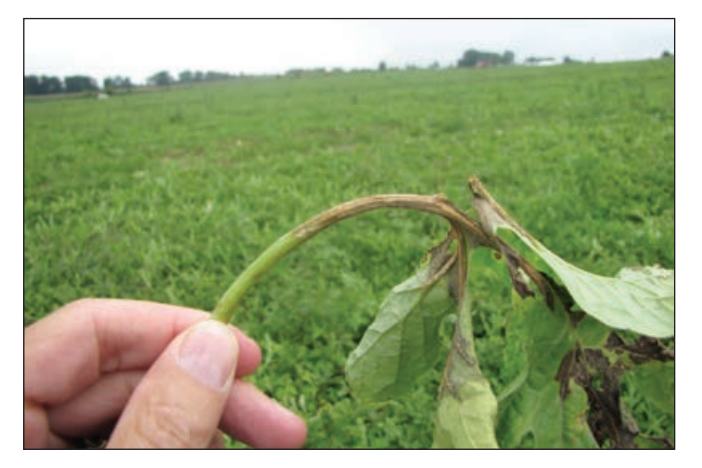
Figure 3. Gummy stem blight on watermelon often turns leaf petioles light brown and produces dark brown, irregular leaf lesions. See page 103 for management options.