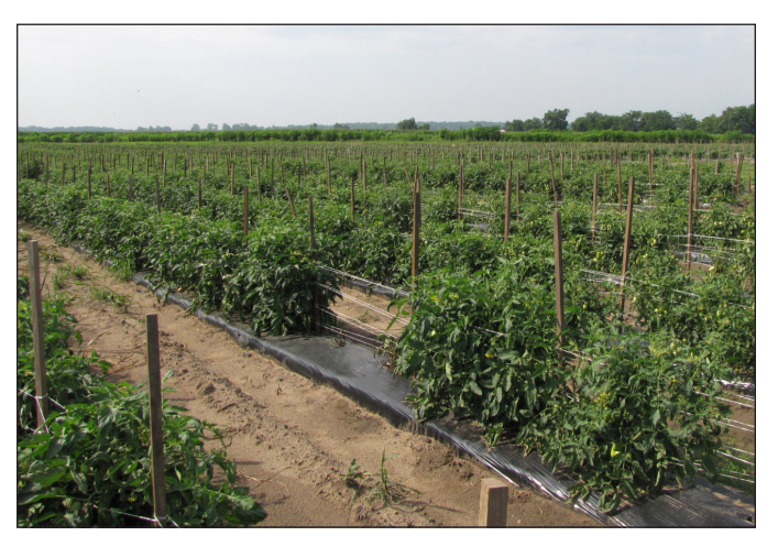
Typical fresh market tomato production in the Midwest includes plants that are tied to stakes with twine using the Florida weave, raised beds, and plastic mulch.

Priaxor <sup>®</sup> at 4-8 fl. oz. per acre. Suppression only. Not for greenhouse use. 0-day PHI.