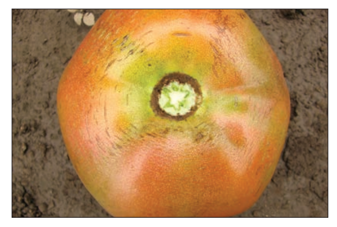
Figure 19. Micro-cracks or rain checks. See page 114 for more information.