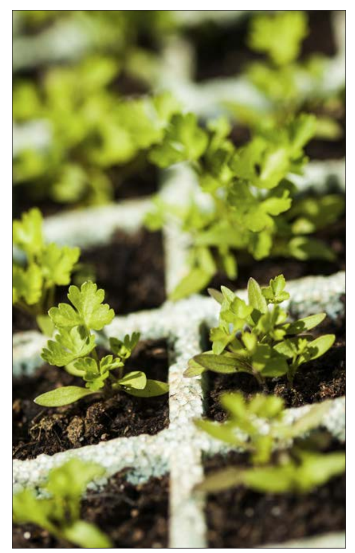
These parsley transplants will have an advantage over plants that are direct seeded.