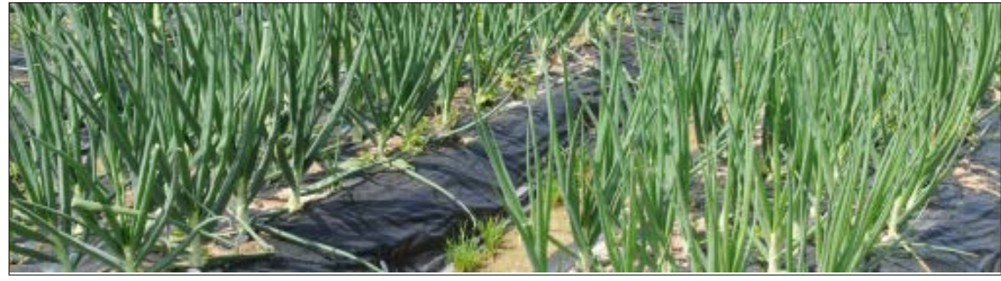
Using black plastic mulch with onions may warm the soil and help manage weeds.

Lannate SP<sup>®</sup> at 1 lb. per acre. Green onion: do not exceed 5.4 lbs. a.i. per acre. Dry bulb : do not exceed 3.6 lbs. a.i. per acre. 7-day PHI. RUP .