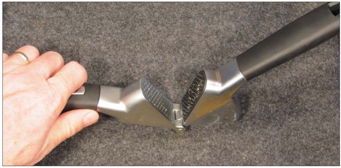
A garlic press may be used to extract sap for petiole testing.