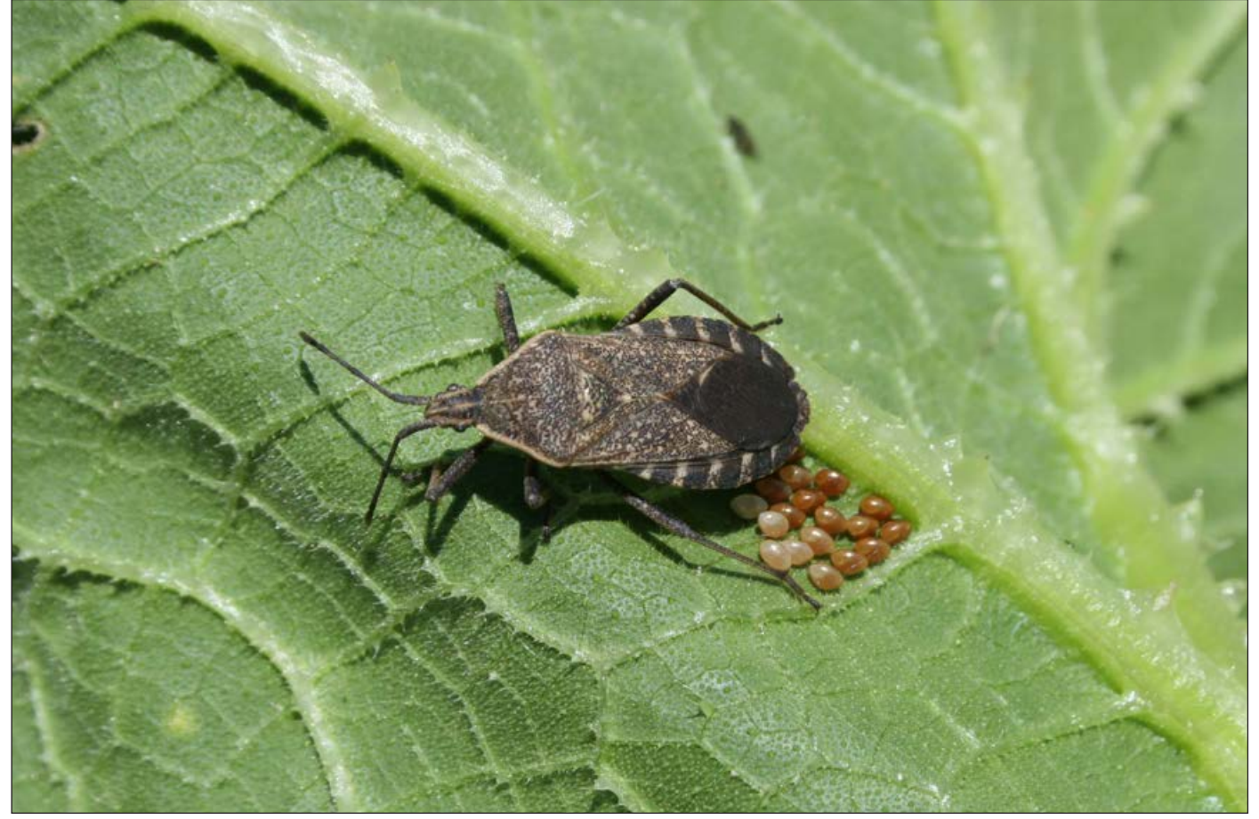
Applying an insecticide to manage squash bugs is warranted in the early season when wilting is present, and at early flowering when more than one egg mass per plant is observed.