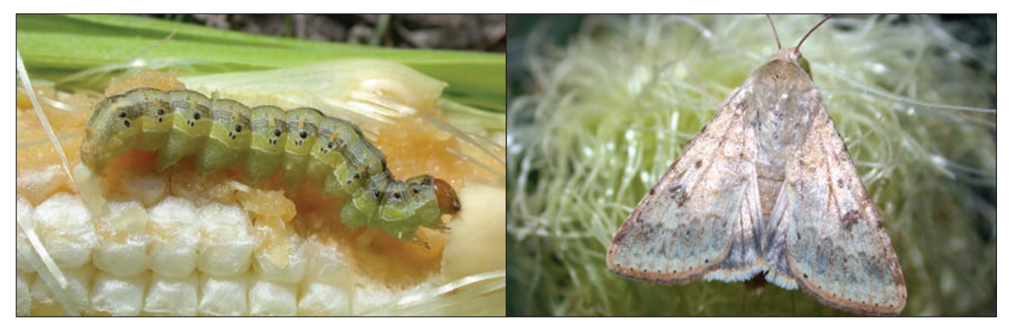
Figure 11. Corn earworm larva (left) can be a significant sweet corn pest. The adult (right) is shown for identification purposes. See page 195 for management options.