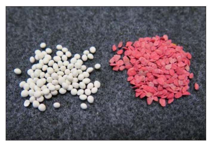
Tomato seeds that have been pelleted for ease of handling (left) will have a lower number of seeds per ounce than unpelleted seeds (right). See Table 15 (page 39).

Check the pesticide label for the particular crop, pest, and site of your planned use.