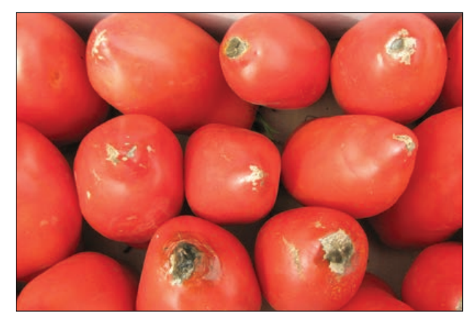
Figure 20. These roma tomatoes suffer from varying degrees of blossom end rot. See page 115 for management options.