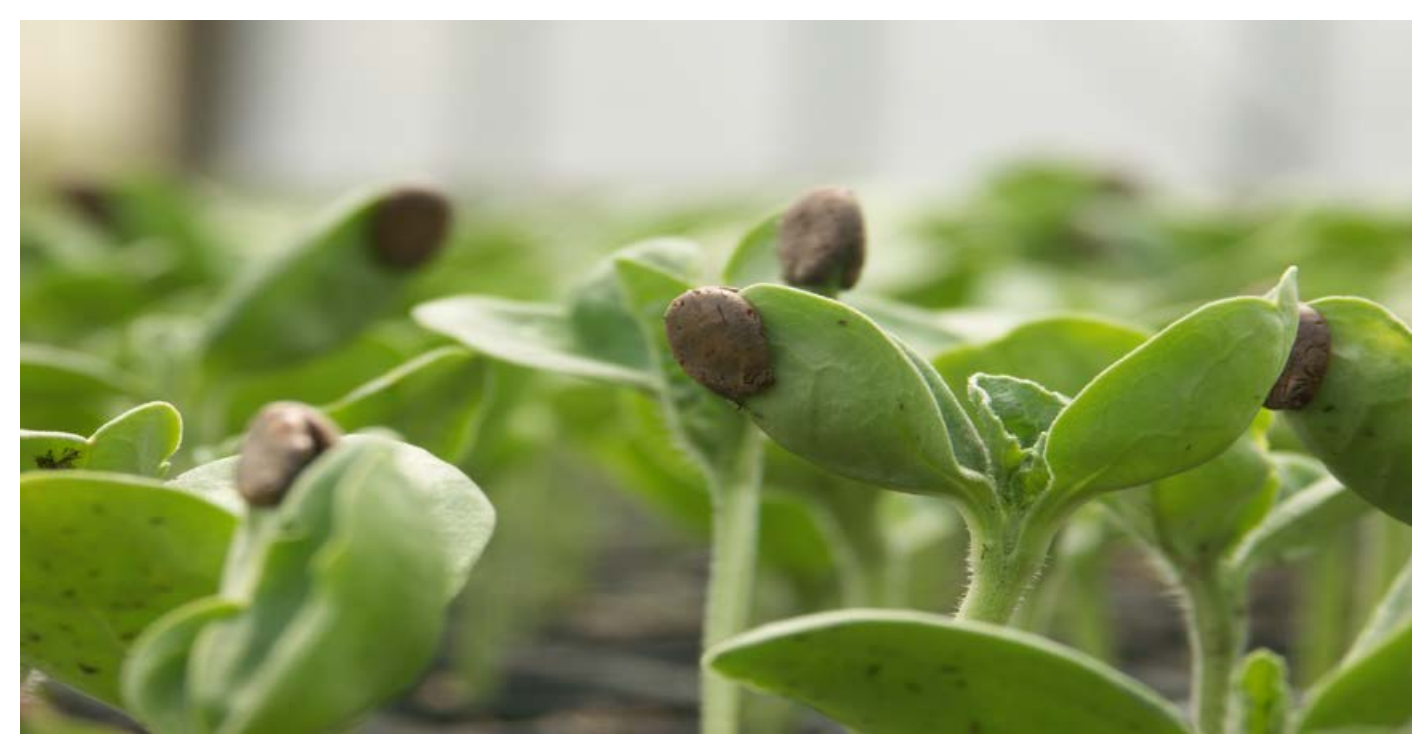
Watermelon seedlings being grown as transplants in a commercial greenhouse.