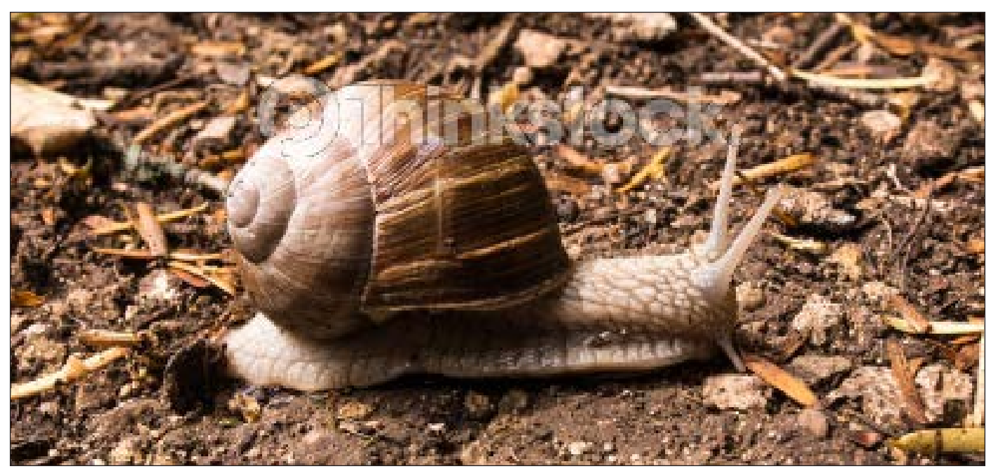
Slugs and snails prefer moist soils and plenty of organic matter.

As a last resort, metaldyhyde bait (e.g., Clean Crop, 3.5G° at 30-40 lbs./A or Clean Crop 7.5G° at 15-20 lbs./A) can be used and is usually very effective. Follow label instructions carefully for application methods for each particular vegetable crop. Apply bait in evening after a rain or irrigation. An organic alternative to metaldehyde is iron phosphate. Baits containing iron phosphate are sold under the trade name Sluggo° (and others) and are only slightly less effective than metaldehyde baits.