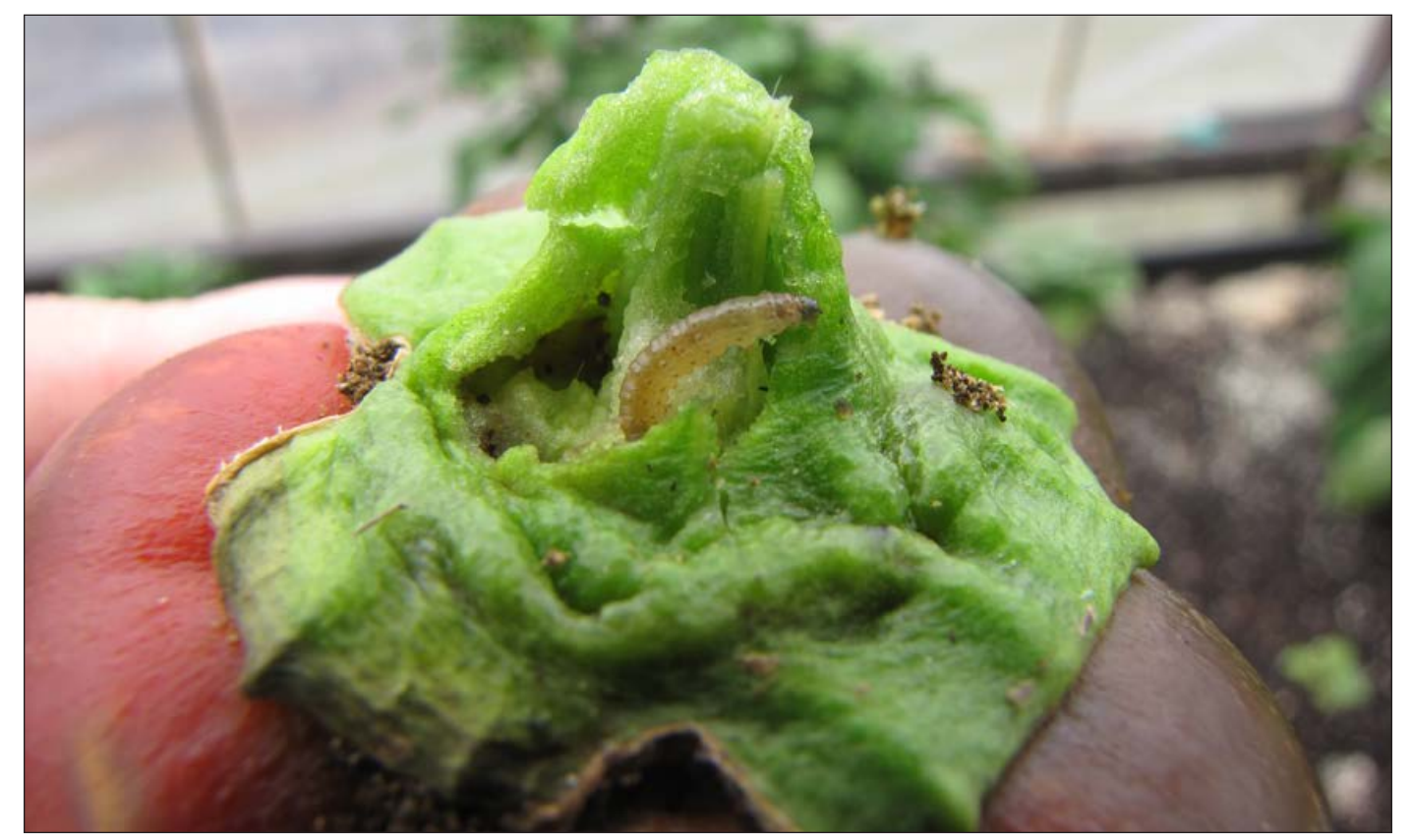
Before considering a management option, it's important to first correctly identify the insect responsible for plant feeding. This is a European corn borer attacking a pepper fruit.

It is important to occasionally rotate products with different modes of action in order to reduce the potential of insect and mite populations developing resistance to products with specific modes of action. A pesticide's mode of action is how it affects the metabolic and physiological processes in the pest (in this case, the pests are insects or mites). Many product labels contain resistance management information or guidelines that will help vegetable growers determine which products they should rotate with others. For more information associated with rotating different modes of action, contact your state or regional extension entomologist.