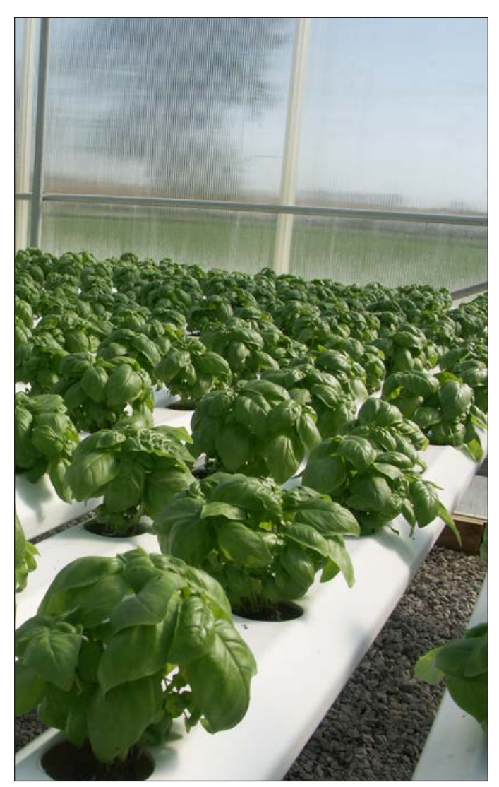
Basil is a potentially high-value crop that may be grown successfully in a hydroponic setting.

Start seeds indoors and transplant seedlings into the field once the danger of frost is over. Thyme reaches a height of 12 inches and a width of 10 to 12 inches. Thyme can be propagated from cuttings, by layering, and division. The pest and disease problems include spider mites and root rot. Harvest the entire plant by cutting them back to 2 inches above ground in midsummer. One more harvest can be expected before the season ends.