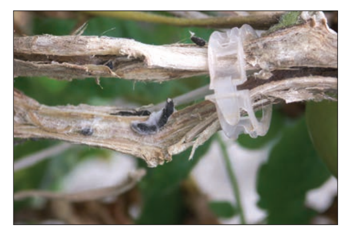
Figure 6. White mold or timber rot of tomato kills stems and entire plants. The black fungal structures (sclerotia) shown here are diagnostic of this disease. See page 125 for management options.