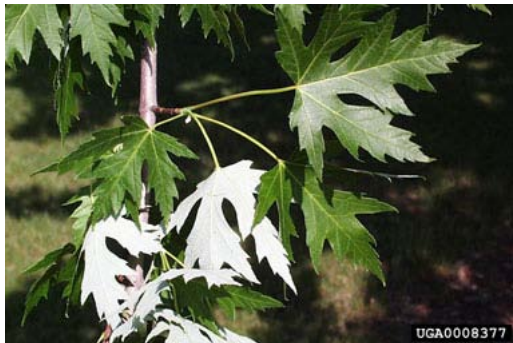
Figure 1 Silver maple foliage.

Contributed by: Kansas State University Forestry Research and USDA NRCS Plant Materials Center Manhattan, Kansas